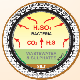
'T' Rib liner protecting RCC Pipe against Corrosion